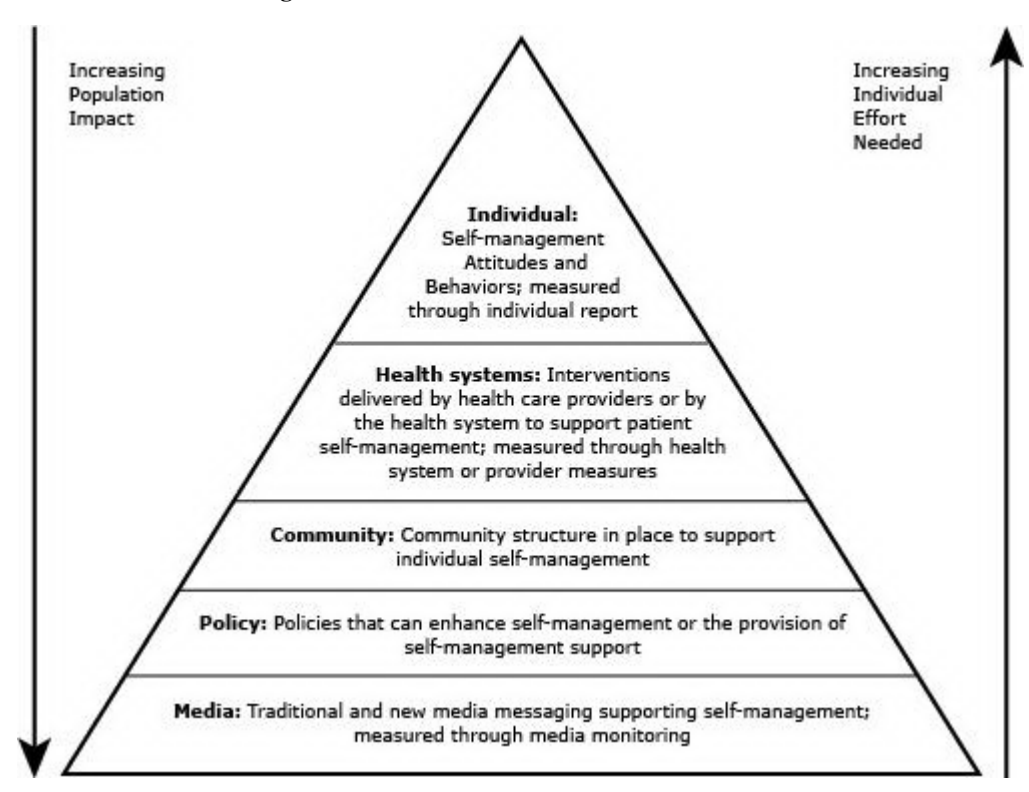
Figure 2. Self-management and self-management support pyramid of public health impact. Adapted from Frieden (9). [A text description of this figure is also available.]

Two frameworks shaped the concept identification: the expanded chronic care model, which highlights SMS arising from the health care system (7), and the social-ecological model, which recognizes the multiple levels of influence (8). We initially brainstormed 37 candidate concepts across 5 ecological levels (individual, health care system, community, policy, media). These 5 levels are also reflected in Friedan's pyramid of public health impact (9) which we tailored to reflect SM and SMS (Figure 2).